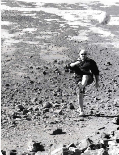
The Lions missed out here.