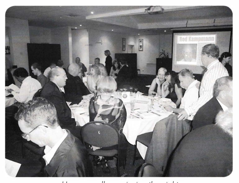
Happy revellers enjoying the night