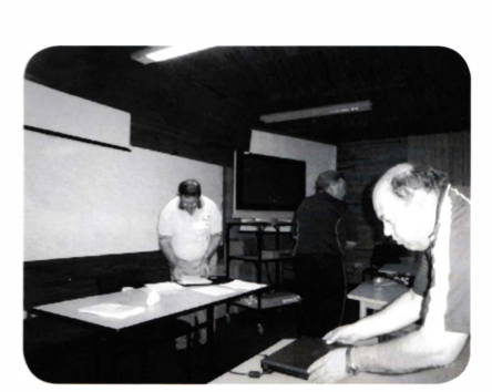
Preparing to present a session at the seminar