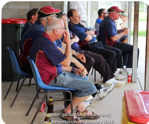
Umpires gather for the Ian Healy Cup presentations in January 2017