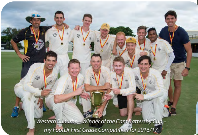
Western Suburbs – Winner of the Cam Battersby Cup – my FootDr First Grade Competition for 2016/17.