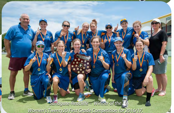
Sandgate-Redcliffe – Winner of the Women's Twenty20 First Grade Competition for 2016/17.