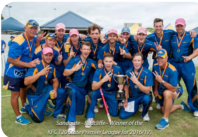
Sandgate - Redcliffe – Winner of the KFC T20 State Premier League for 2016/17.