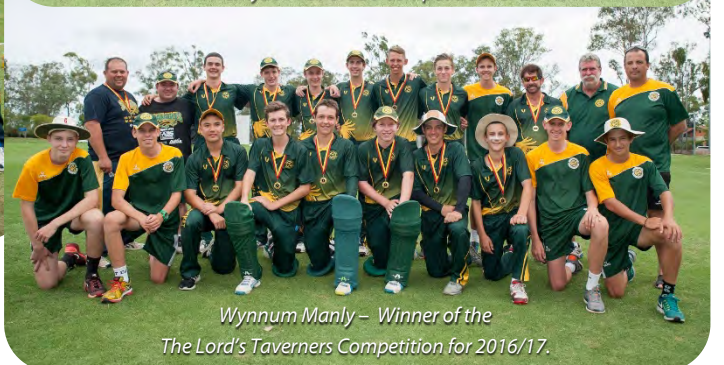
Wynnum Manly – Winner of the The Lord's Taverners Competition for 2016/17.