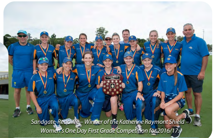
Sandgate-Redcliffe – Winner of the Katherine Raymont Shield – Women's One Day First Grade Competition for 2016/17.