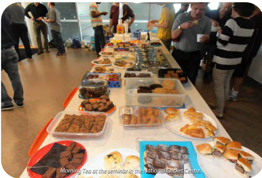
Morning Tea at the seminar in the National Cricket Centre.