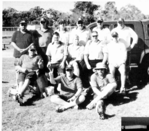
Our Corporate Games Cricket Team.