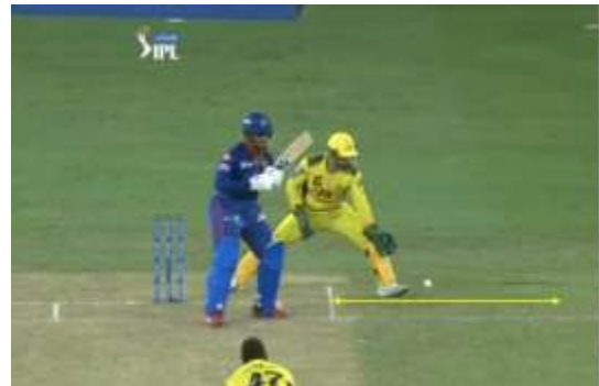
Pitching beyond the line of the striker's wicket