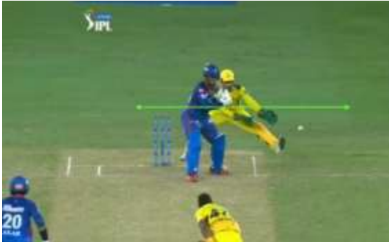
Passing out of reach and below the waist