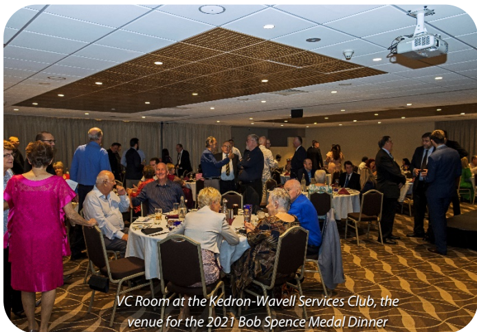
VC Room at the Kedron-Wavell Services Club, the venue for the 2021 Bob Spence Medal Dinner