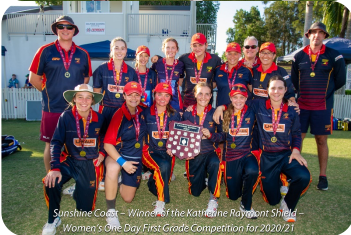
Sunshine Coast – Winner of the Katherine Raymond Shield – Women's One Day First Grade Competition for 2020/21