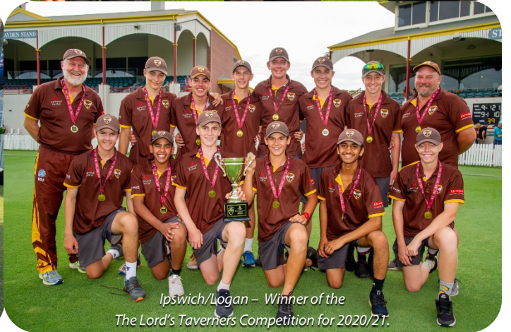
Ipswich/Logan – Winner of the The Lord's Taverners Competition for 2020/21.