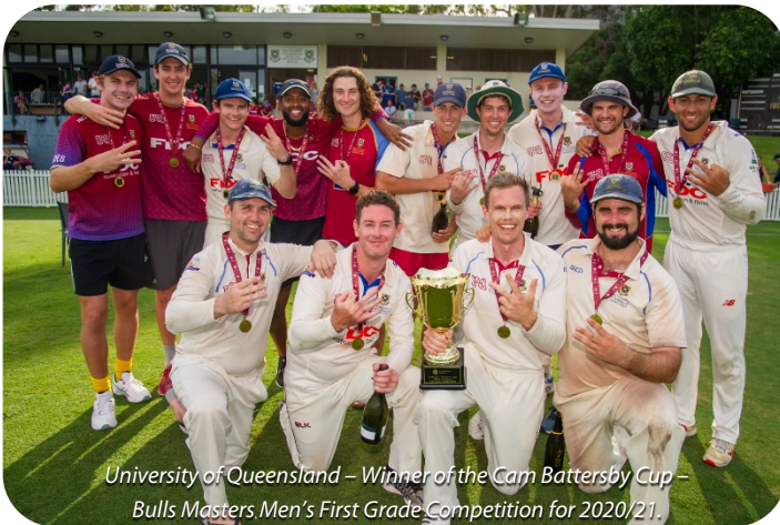
University of Queensland – Winner of the Cam Battersby Cup – Bulls Masters Men's First Grade Competition for 2020/21.