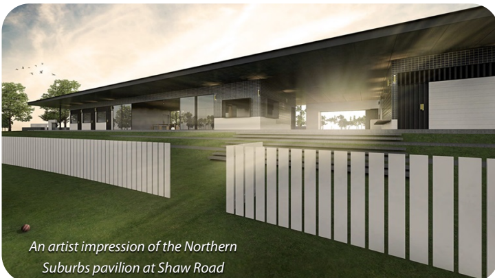
An artist impression of the Northern Suburbs pavilion at Shaw Road

Secure the financial future of cricket in Queensland to fund our ambitions.