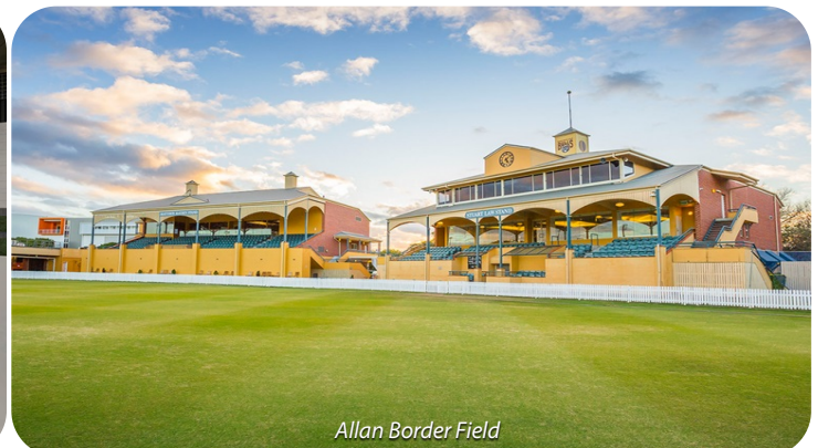
Allan Border Field