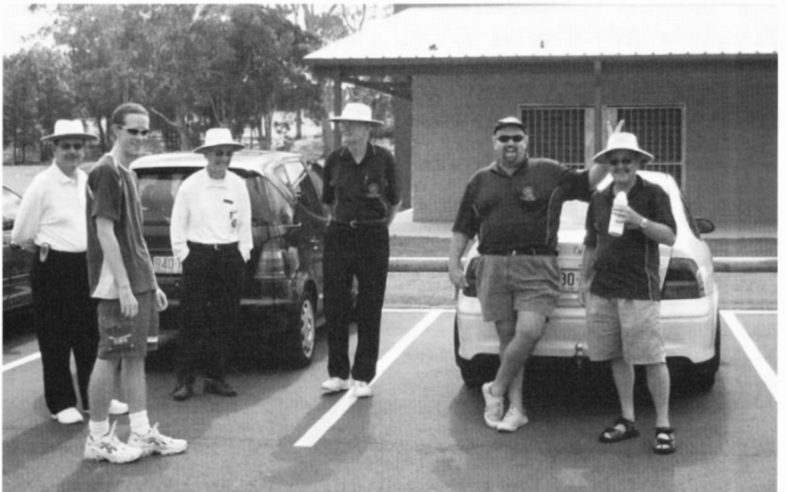
Umpires waiting for the pitch to dry.