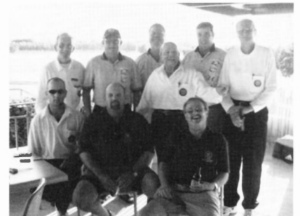
Enjoying a quiet one after the U16 State Championships.