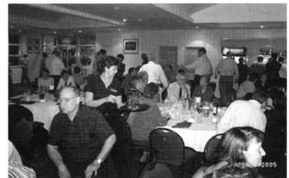
Some of the revellers at our End of Season Dinner.