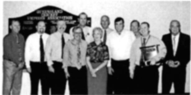
The Bob Spence Medal Finalists